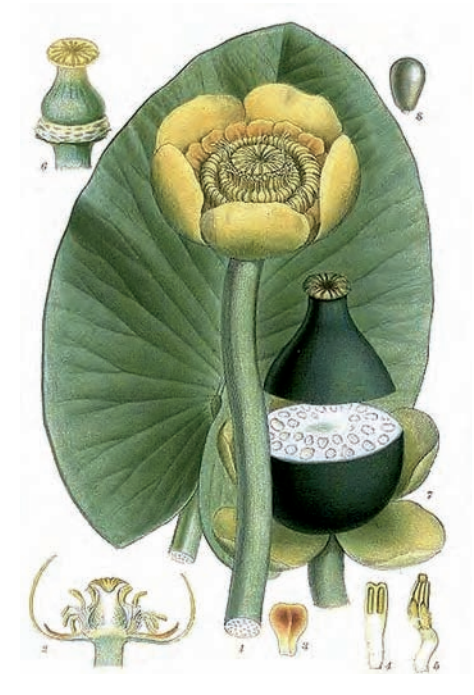
Figure 32: Nuphar luteum - Yellow Pond Lily

with ulcerative damage to the intestinal wall with bloody, slimy diarrhoea from repeated inflammation. Often an autoimmune condition develops which may become cancerous because the sufferer takes on the fatalistic victim role. When something is repeated the sycotic level has been reached.