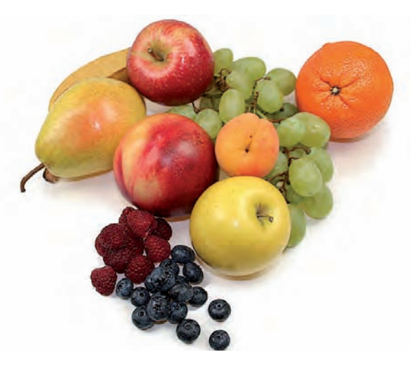
Figure 31: Fruit

When we consider that many of the chronic illness prevalent today have their root in sympathicotonia (an over-stimulated condition of the sympathetic nervous system caused for example by permanent stress) and fatigue of the enteric nervous system, it becomes clear to which extent we immobilise our natural